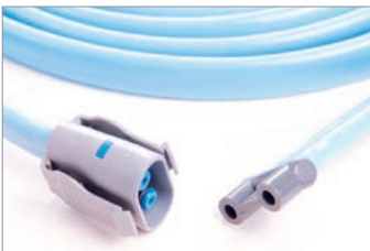
Neonatal, Gray Shroud to Female Slip Luer Compatibility: DINAMAP Pro Series, DINAMAP ProCare, CARESCAPE V100, VC150, Compact, MPS Series Monitors Length: 3.6 m/12 ft Part # 107368