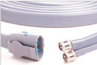
Adult-Pediatric, Gray Shroud to Screw Connector Compatibility: DINAMAP Pro Series, DINAMAP ProCare, CARESCAPE V100, VC150, Compact, MPS Series Monitors Length: 3.6 m/12 ft Part # 107365