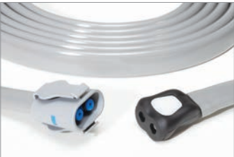
Adult-Pediatric, Gray Shroud to DINAClick™ Connector Compatibility: DINAMAP Pro Series, DINAMAP ProCare, CARESCAPE V100, VC150, Compact, MPS Series Monitors Length: 3.6 m/12 ft Part # 2058205-001 Length: 7.2 m/24 ft Part # 2058205-002

GE Healthcare provides a comprehensive portfolio of air hoses for use with GE monitors connecting to CRITIKON™ blood pressure (BP) cuffs. The air hoses are offered in a variety of lengths and connectors for neonatal and for pediatric/adult use. The hoses are not made with natural rubber latex and help prevent air leakage by providing a secure connection to the BP cuff.