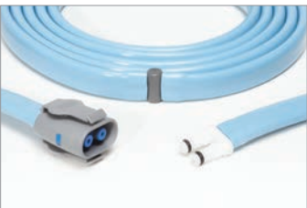
Neonatal, Gray Shroud to Neo-Snap* Connector Compatibility: DINAMAP Pro Series, DINAMAP ProCare, CARESCAPE V100, VC150, Compact, MPS Series Monitors Length: 3.6 m/12 ft Part # 2058206-001