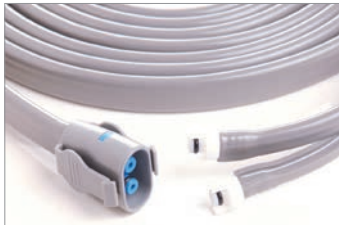
Adult-Pediatric, Gray Shroud to Subminiature Connector Compatibility: DINAMAP™ Pro Series, DINAMAP ProCare, CARESCAPE™ V100, VC150, Compact, MPS Series Monitors Length: 3.6 m/12 ft Part # 107363