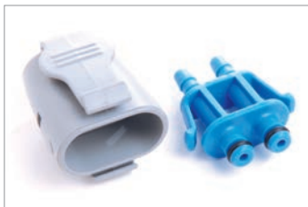
Air Hose Instrument Connector Assembly Part # 330073